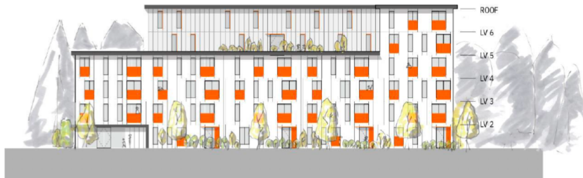
Figure 1: Concept drawing prepared by Fold Architecture.

Notice sent pursuant to TWN Land Code on March 3, 2021