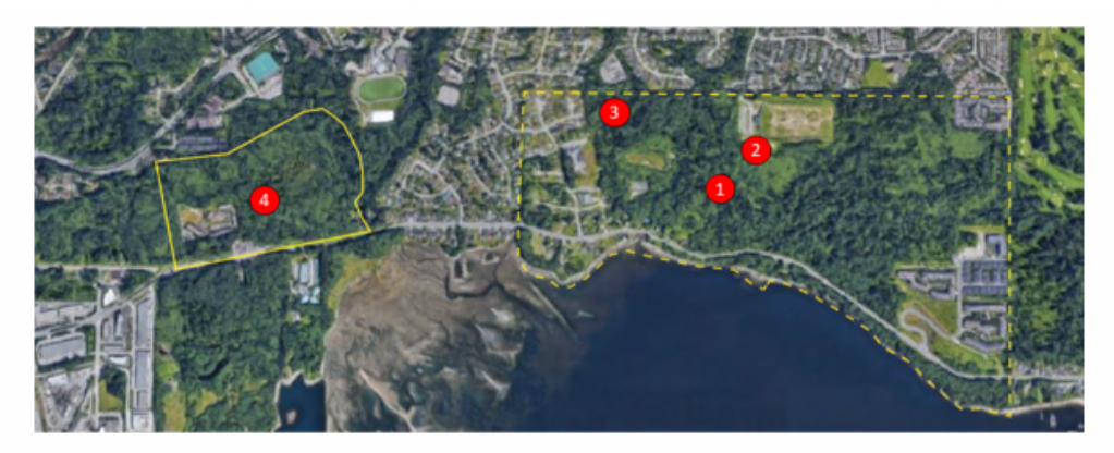
Figure 1: Map of Project Locations; 1. Apex Connector, 2. FNHA Office Building, 3. Community Subdivision, 4. Maplewood Lands